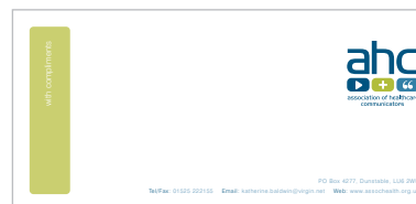
1/3 A4 Compliment Slip